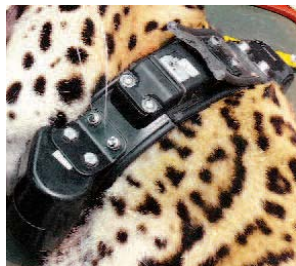
The radio collar that was fitted on the leopard